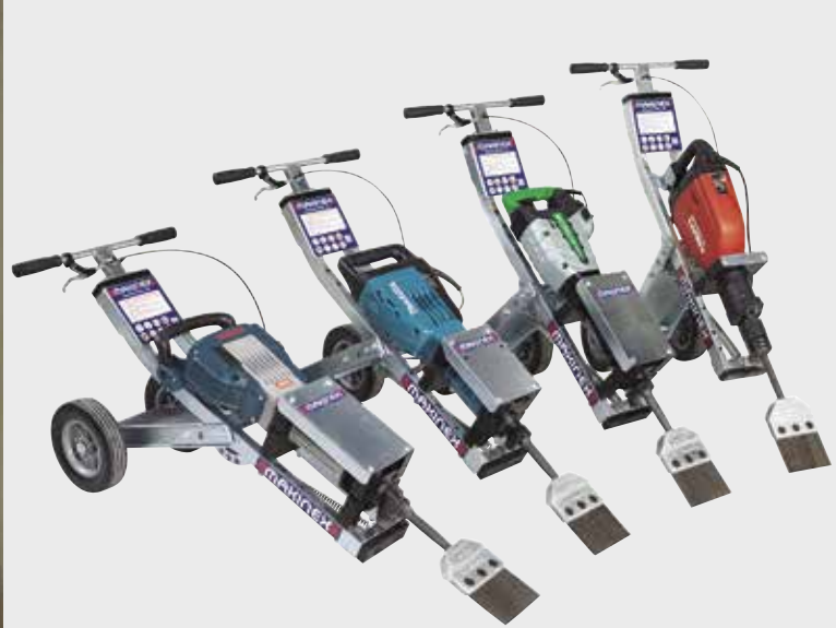
The JHT suits most 16kg jackhammers.

// I am able to complete jobs faster, which allows me to bid and win more jobs. //