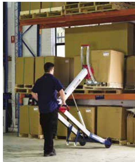
(left) Fork attachment comes with removable tilt head and fork lift arms, sold separately.