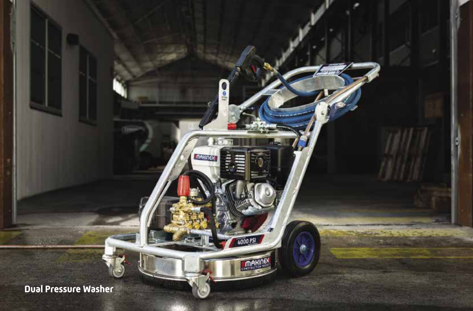
Dual Pressure Washer