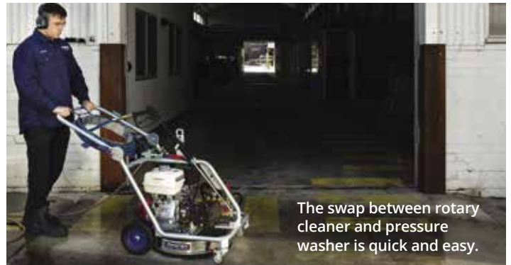
The swap between rotary cleaner and pressure washer is quick and easy.