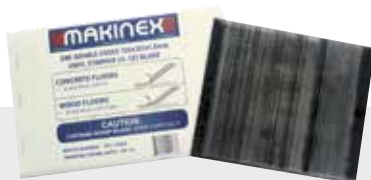
Spare blades available