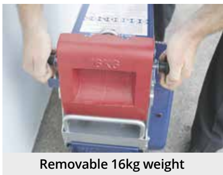
Removable 16kg weight