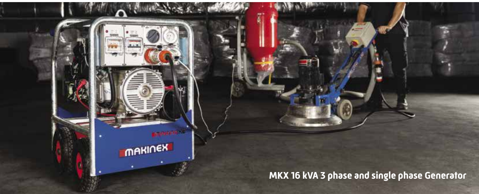
MKX 16 kVA 3 phase and single phase Generator

Our products provide contractors and tradespeople with a better way to do their jobs – faster, safer and easier.