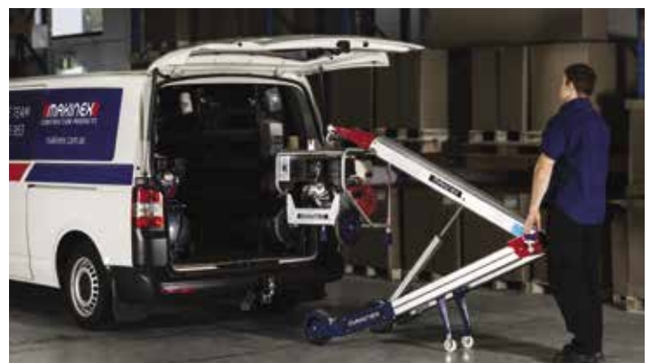
(below) Hook attachment comes standard and is used for lifting, moving and loading small equipment and machinery fitted with a lifting eye, e.g. water pumps, generators, air compressors, plate compactors.