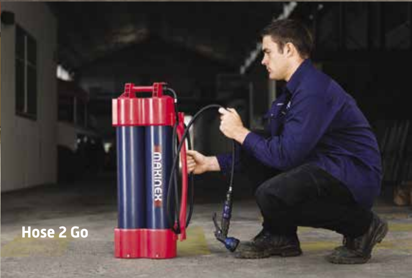
Hose 2 Go