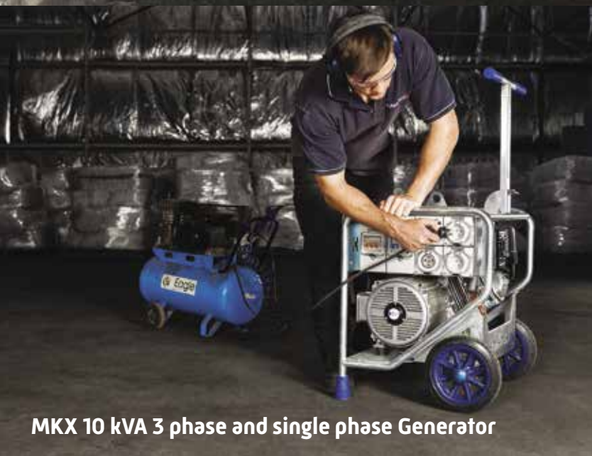
MX 10 kVA 3 phase and single phase Generator