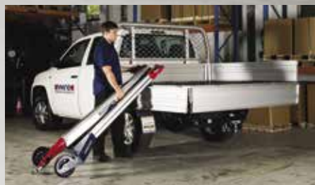
Folds flat for storage