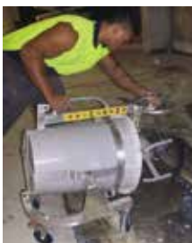
Easy tilt system for pouring