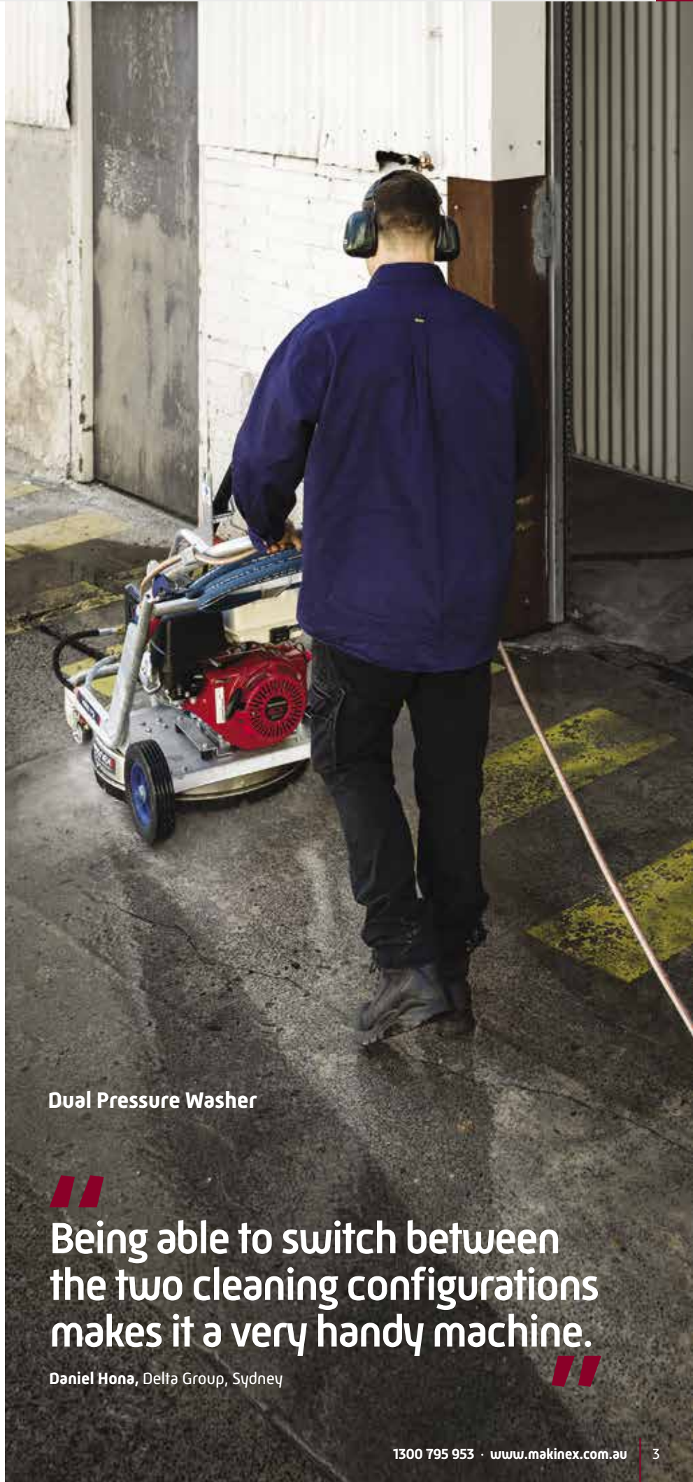
Dual Pressure Washer

“ Being able to switch between the two cleaning configurations makes it a very handy machine. ”