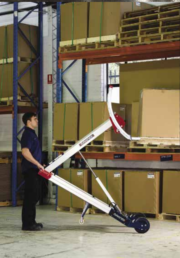
Powered Hand Truck