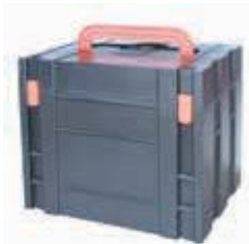
Plastic Carry Case